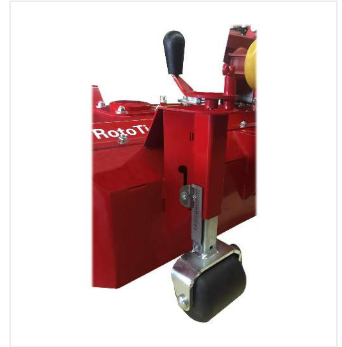
Adjustment spindle lock mechanism for the working depth